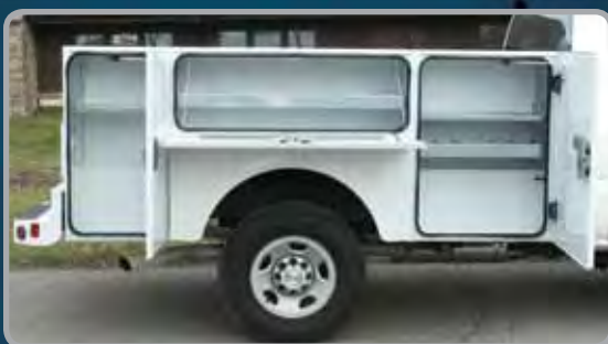
Full-height doors and large clear door openings allow quick, convenient access to tools and equipment

Covered by STAHL's 5-Year "No Rust, No Bust" warranty