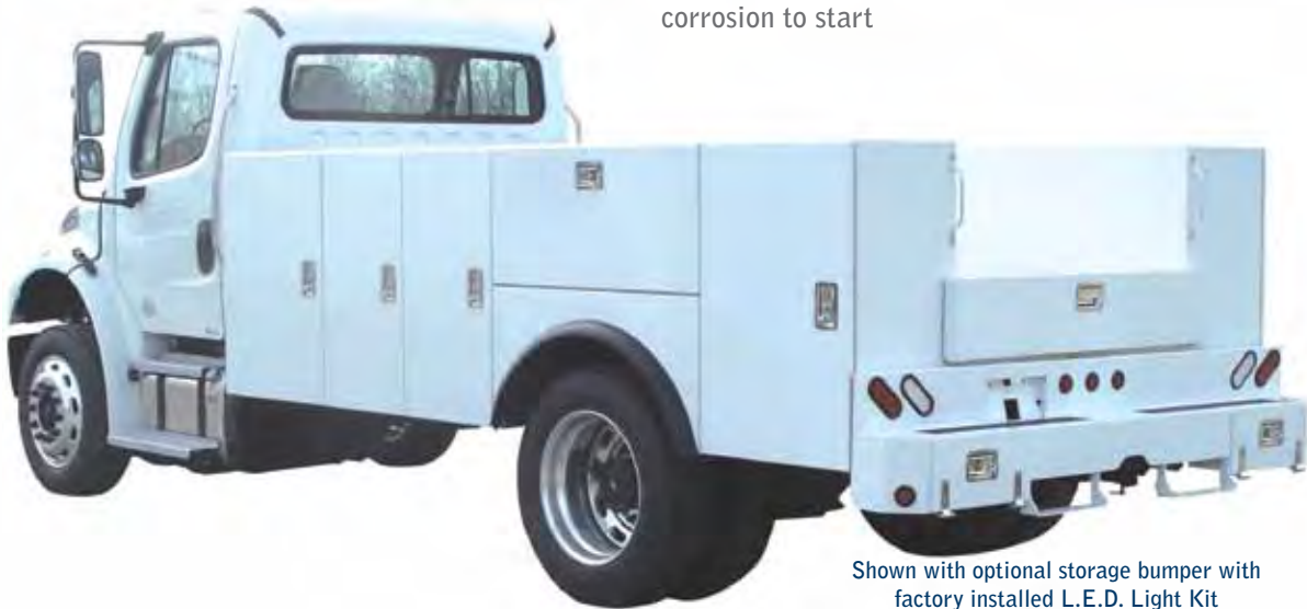
Shown with optional storage bumper with factory installed L.E.D. Light Kit

Lock-bolt construction provides exceptional strength and durability at the same time eliminating the need for any cutting, welding or grinding which can allow corrosion to start