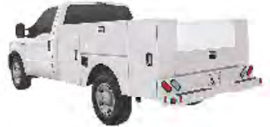
Shown with optional recessed lighted bumper