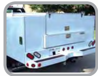
Low Sliding Roof