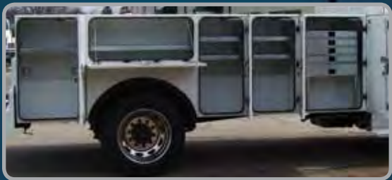
44.5" high compartments with large door clearance provide ample storage space and easy access to tools and equipment (optional Drawer package pictured above)

Covered by STAHL's 5-Year "No Rust, No Bust" warranty