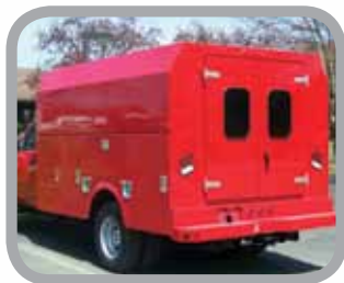
High Roof (60" pictured)