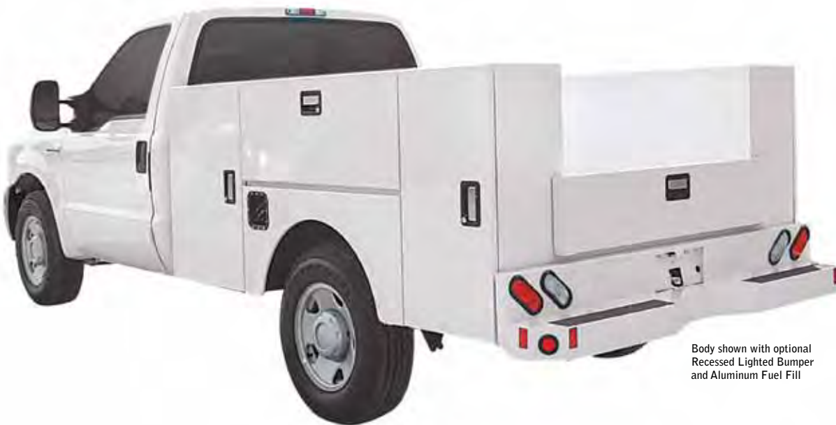
Body shown with optional Recessed Lighted Bumper and Aluminum Fuel Fill

Lock-bolt construction provides exceptional strength and durability at the same time eliminating the need for any cutting, welding and grinding which can allow corrosion to start