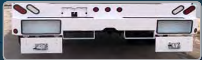
Optional storage bumper features dual locable compartments, factory installed L.E. D. light kit, twin steps and recess for optional hitch package