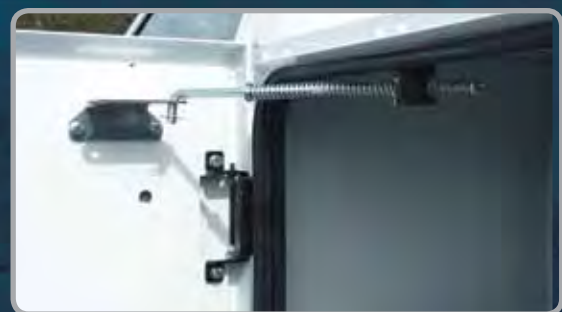
Fully hidden bolt-on hinges offer maximum security while making maintenance fast and easy