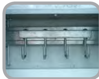
Optional Compartment J-Hooks