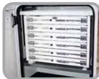
Optional Drawer Packages