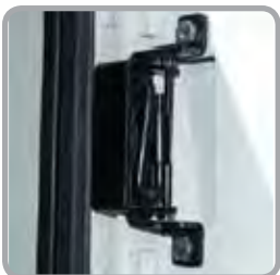
Hidden Bolt-On Hinges

The service body exterior, compartment interiors and cargo area surfaces are finished in durable, corrosion-resistant white powder coat