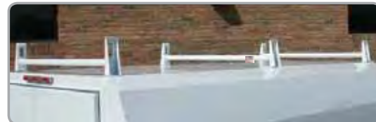
Optional Overhead Ladder Rack