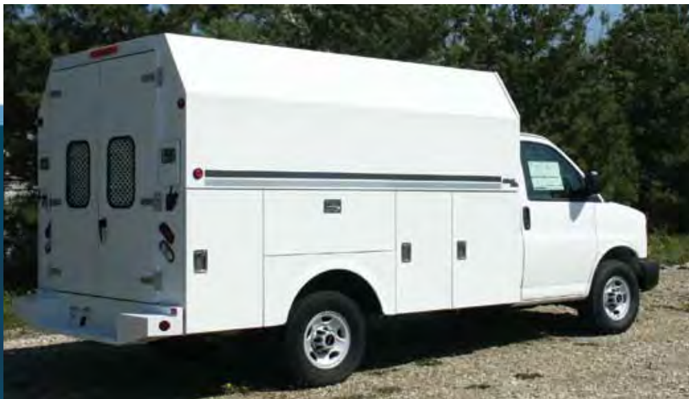
USV Shown with Conduit Door option

Covered by a 5-Year "No Rust, No Bust" warranty