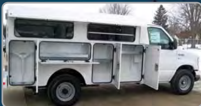
Optional Flip-Up Side Access Doors allow access to load space shelving

Covered by a 5-Year "No Rust, No Bust" warranty