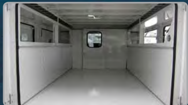
Large interior load space provides plenty of secured storage