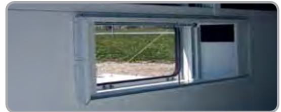
Optional Horizontal Compartment Pass-Thru