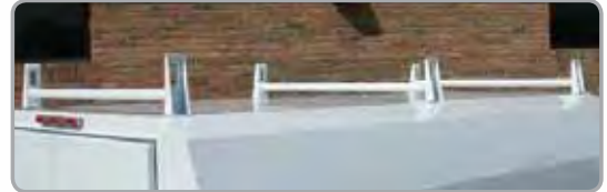
Optional Overhead Ladder Rack