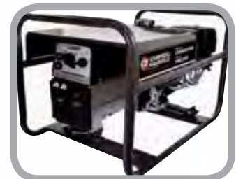
Optional Generator / Welder