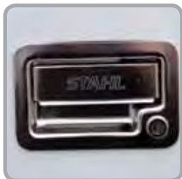
Stainless Steel Latches