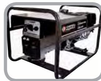
Optional Generator / Welder