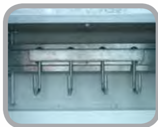
Optional Compartment J-Hooks