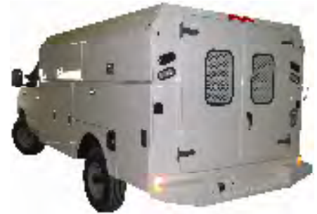
129 SRW Garage Height model shown with optional Flip-Up Side Access Doors