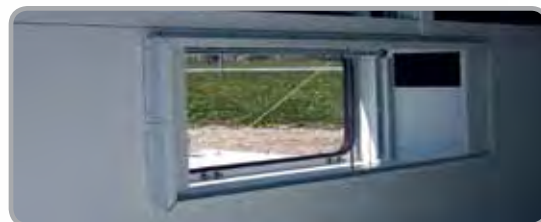
Optional Horizontal Compartment Pass-Thru