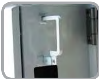
Optional Bar Locks