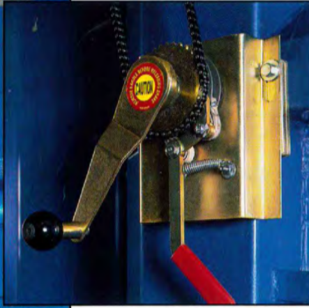
One-hand, positive locking, automatic function brake. Shown without crank cover.