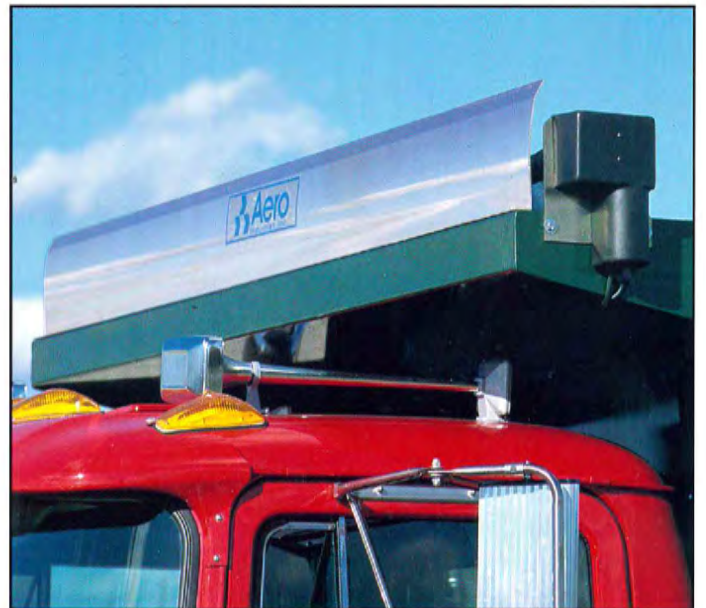
Optional wind deflector to reduce drag and extend tarp life.