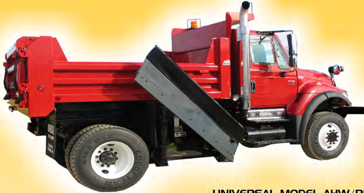
UNIVERSAL MODEL AHW/PDF II 7' JR. WING (MID-MOUNT)