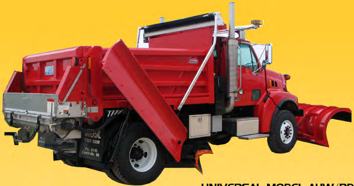
UNIVERSAL MODEL AHW/PDF II 8' JR. WING (REAR MOUNTED)