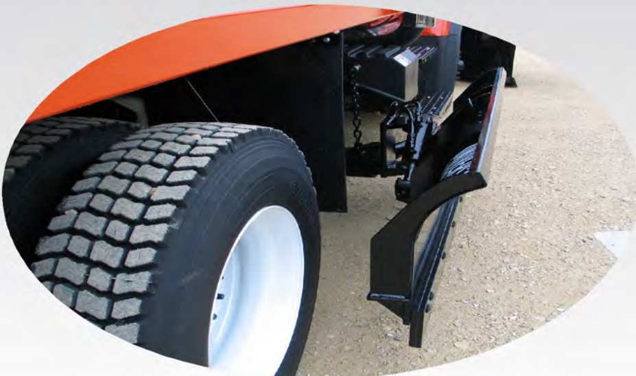
WING FOLDS UP TIGHT TO TRUCK