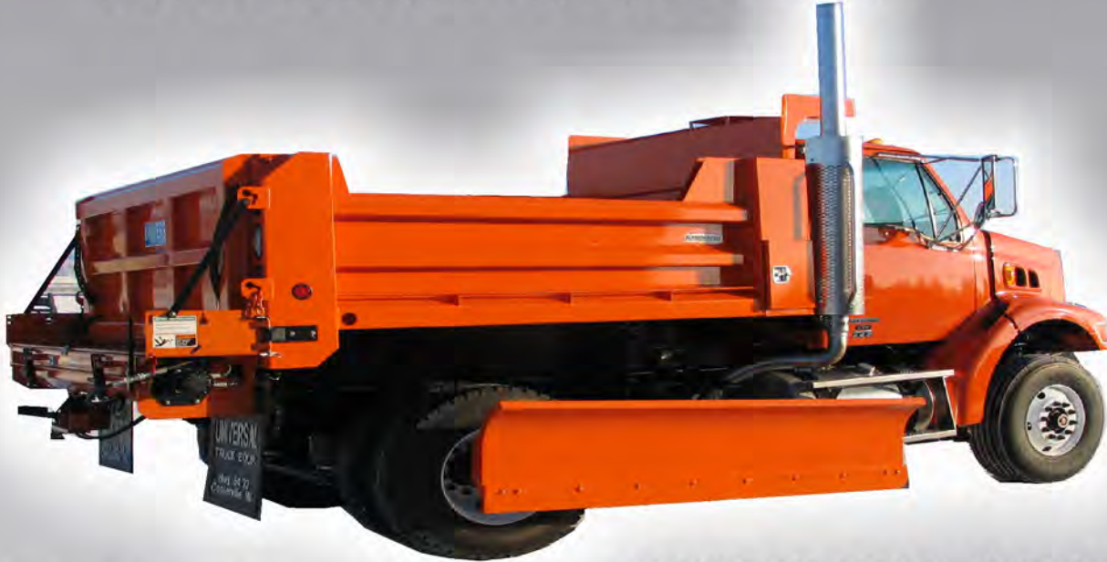
UNIVERSAL MODEL AH/FOW/NB 7' FOLD OUT WING